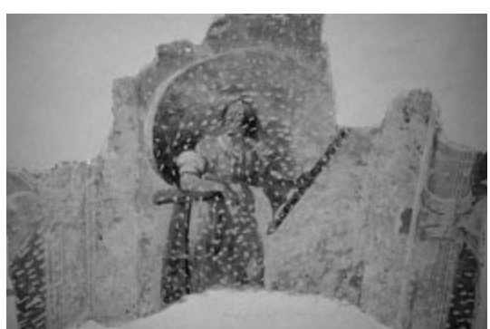
7-8. Detail of the Room of fragments of Navigation and of the tritons in palazzo Nicolosio Lomellino in Genoa, during the restoration