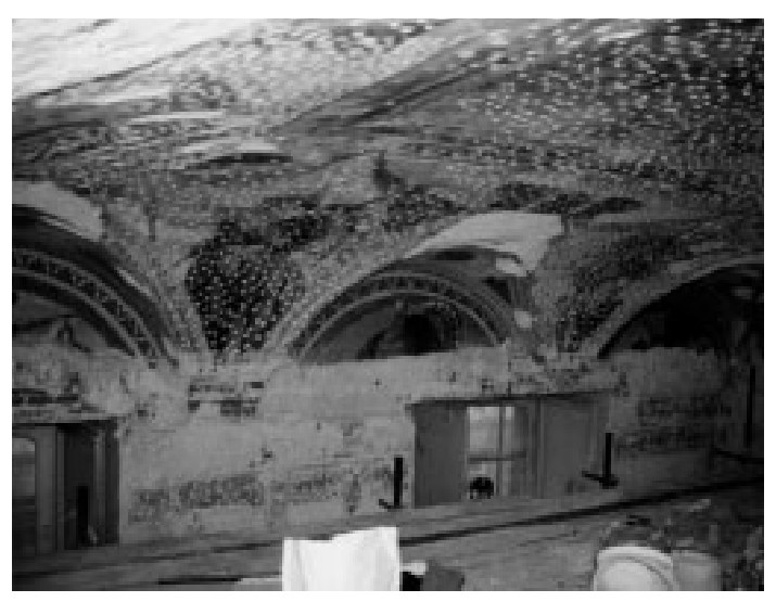
4. Pendentives with fishing scenes and lunette with parrots in the Room of the Allegory of the Faith in palazzo Nicolosio Lomellino in Genoa during the restoration