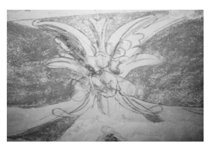
6. Mask in the Astrology Room in palazzo Nicolosio Lomellino in Genoa during the restoration